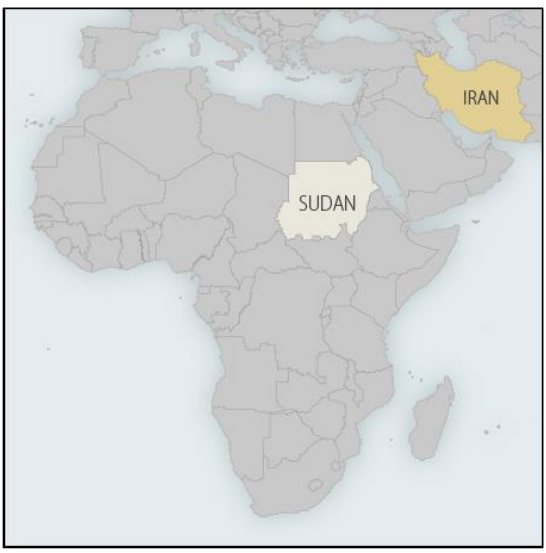
Figure 6. Sudan

The overwhelming majority of Muslims in Africa are Sunni, and Muslim-majority African countries have tended to be responsive to financial and diplomatic overtures from Iran's rivals in the GCC. Amid a Saudi-Iran dispute in January 2016 over the Nimr execution, several African countries broke relations with Iran outright, including Djibouti, Comoros, Somalia, and Sudan. The UAE, in particular, has actively sought allies