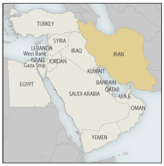
Figure 2. Map of Near East

Iran has a 1,100-mile coastline on the Persian Gulf and Gulf of Oman, and exerting dominance of the Gulf has always been a key focus of Iran's foreign policy, including during the reign of the Shah. In 1981, perceiving a threat from revolutionary Iran and spillover from the Iran-Iraq War that began in September 1980, six Gulf states-Saudi Arabia, Kuwait, Bahrain, Oatar, Oman, and the United Arab Emirates—formed the Gulf Cooperation Council alliance (GCC). U.S.-GCC security cooperation expanded during the 1980-1988 Iran-Iraq War and became formalized after the 1990 Iraqi invasion of Kuwait. Prior to 2003, the extensive U.S. presence in the Gulf was in large part to contain Saddam Hussein's Iraq but, with Iraq militarily weak since Saddam's ouster, the U.S. military presence in the Gulf focuses primarily on containing Iran and