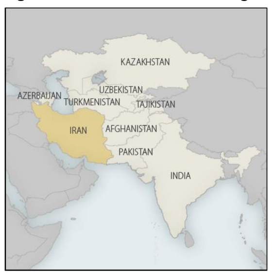
Figure 4. South and Central Asia Region

Azerbaijan is, like Iran, mostly Shia Musliminhabited. However, Azerbaijan is ethnically Turkic and its leadership is secular. Iran and Azerbaijan also have territorial differences